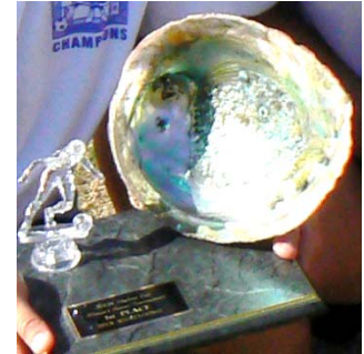
The coveted Abalone--a one of a kind trophy!