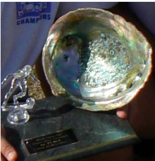
The coveted Abalone--a one of a kind trophy!